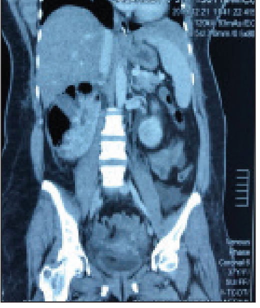
Figure 2: CT-IVU of same patient next day(Worsening Type 1 EPN)