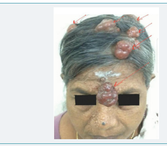
Figure 1: Multiple non-tender discrete soft skin coloured nodules measuring 3cm × 3cm distributed mainly over frontal, parietal and over the vertex of the scalp and firm papules measuring 2-8mm in diameter located mainly on the nasolabial folds, the nose, the forehead and the upper lip.