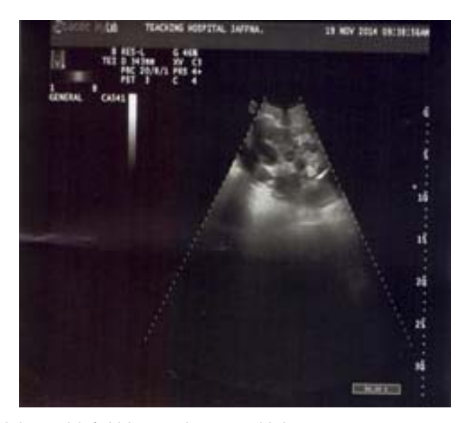
Figure 1. (a) and (b): Ultrasound scan of right and left kidneys shows multiple cysts