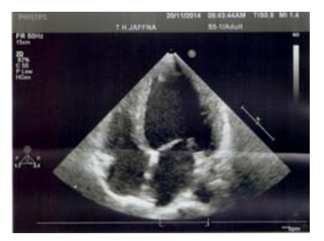
Figure 2. (a) and (b): 2D echocardiogram demonstrates dilatation of all four cardiac chambers